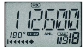
CDI mode display

The IC-A24/E has VOR navigation functions. The DVOR mode shows the radial to or from a VOR station and the CDI mode shows the course deviation to/from a VOR station. You can also input your intended radial to/from the VOR station and show the course deviation on the display. In the USA version, the duplex operation allows you to call a COM channel, while you are using VOR navigation. (* IC-A24/E only)